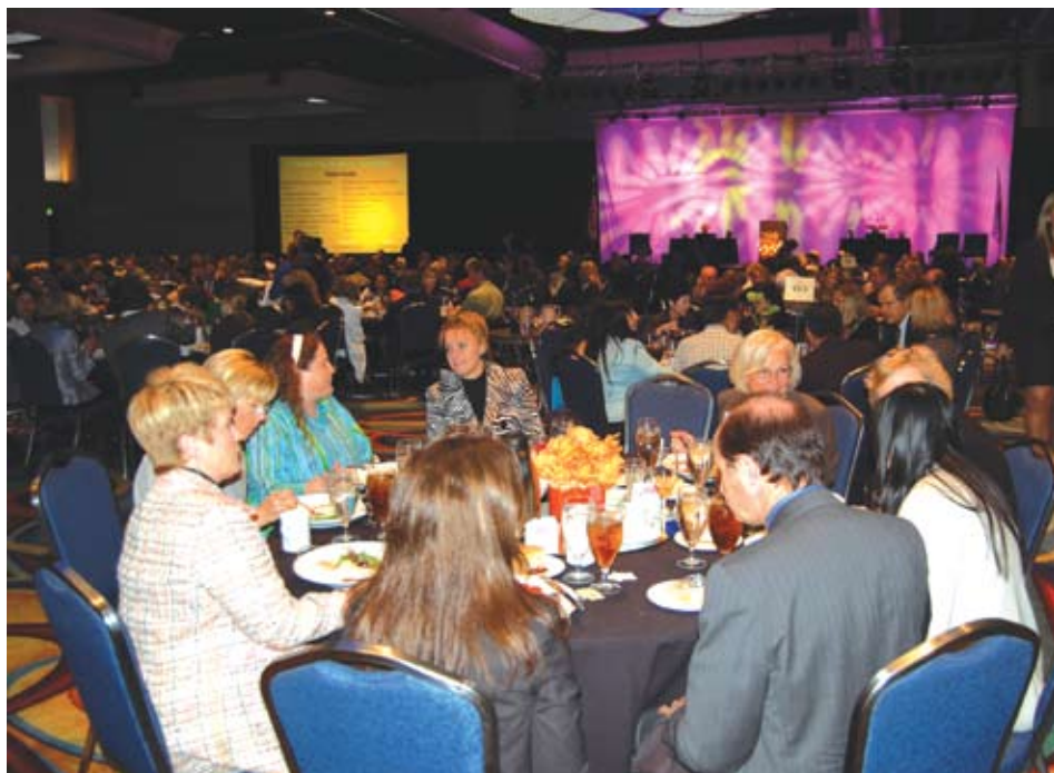
750 guests attend National Philanthropy Day.